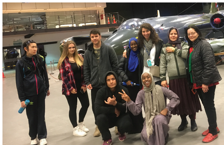
Anne Frank - Airforce Museum