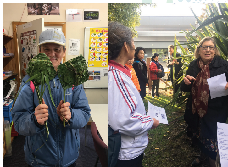
Art class - Flower Weaving

Hagley College Ph: 03- 3793090 (Ext 810) or 021 02409710 We hope to see you there!